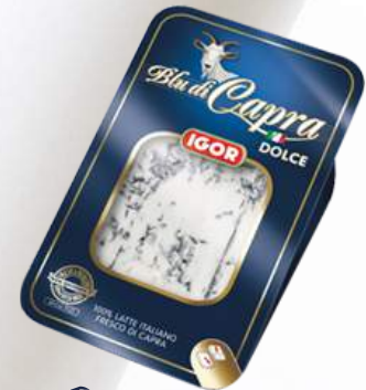
Blu di Capra 1/8